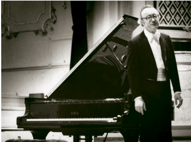
Above: 1987, new model F308 prototype

Following the expansion of the production area inside the MIM factory, as well as the introduction of modern technology, output hit 6 units per month in this period.