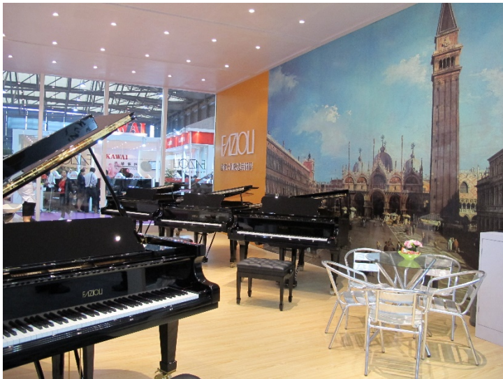
Above: Anaheim, Los Angeles, 1994, NAMM Show

The unique Brunei concert grand was built to order for the Sultan of Brunei, featuring inlays of precious stones, mother of pearl and exotic woods. In addition to standard black instruments, the company developed a series of special art case models to cater to its most exacting customers.