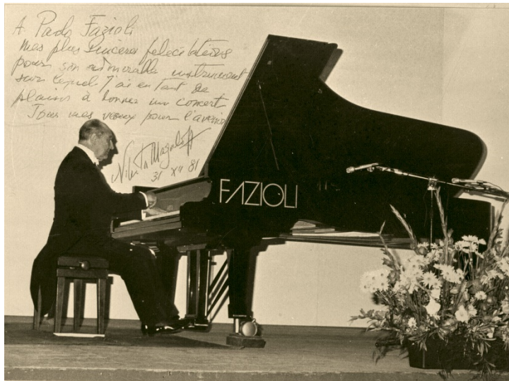
Above: Frankfurt, Germany, 1981, Musikmesse