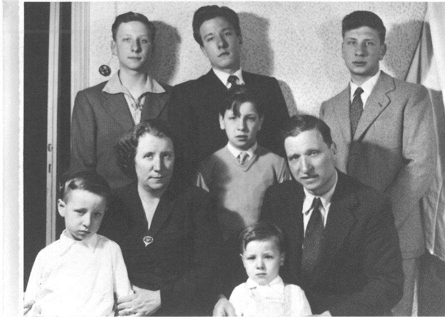
The FAZIOLI family in 1947