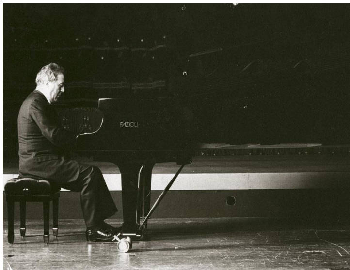
Above: Frankfurt, Germany, 1982, Musikmesse

The demand for an instrument having even greater power and richness of tone, to be used in large concert halls, inspired the concept of the F308 model, which is still the longest piano available on the market. Alongside this project, work began on a new model to complement the existing line, the medium-size F212 with a length of 212 cm.