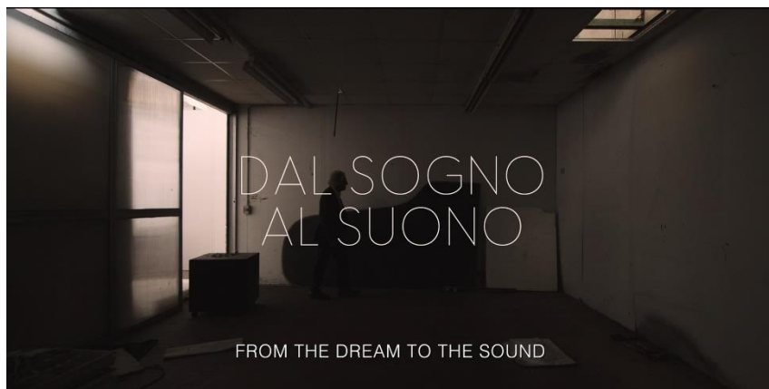
Above: Celebration of the Fazioli Company 40th Anniversary