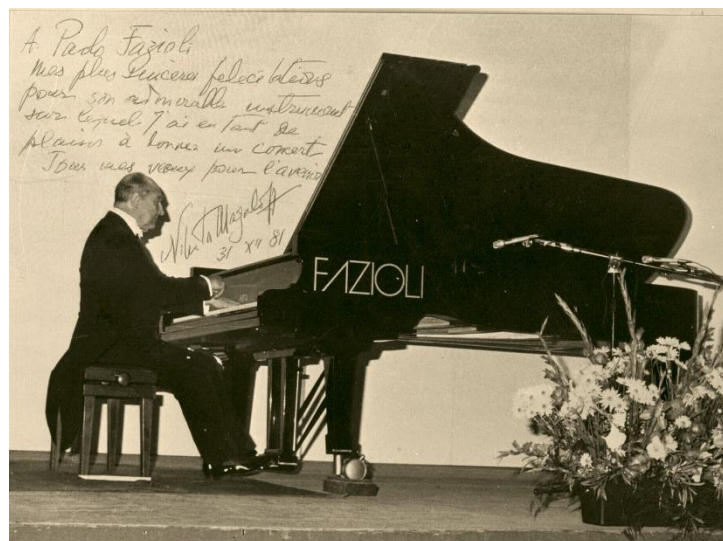
Above: Frankfurt, Germany, 1981, Musikmesse