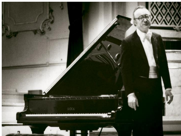
Above: 1987, new model F308 prototype

Following the expansion of the production area inside the MIM factory, as well as the introduction of modern technology, output hit 6 units per month in this period.