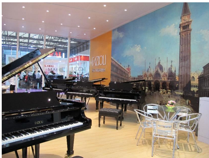
Above: Anaheim, Los Angeles, 1994, NAMM Show

The unique Brunei concert grand was built to order for the Sultan of Brunei, featuring inlays of precious stones, mother of pearl and exotic woods. In addition to standard black instruments, the company developed a series of special art case models to cater to its most exacting customers.